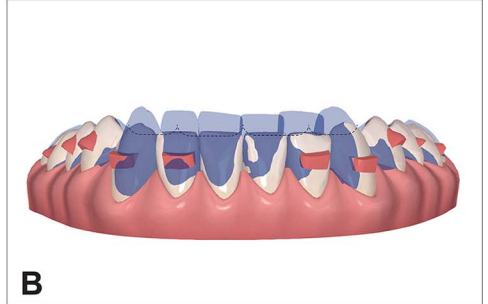
Figure 2. Implementation of reverse curve of Spee mechanics. More overcorrection of mandibular incisor intrusion could be considered in adults (A) compared with adolescents (B).

The clinical implications drawn from this study suggest that orthodontists could contemplate reducing the degree of overcorrection for mandibular incisor intrusion in adolescents presenting with deep overbite. To illustrate, orthodontists might treatment plan a simulated 0.5-mm overbite for adolescents while considering a 0.5-mm simulated open bite or greater for adults, accompanied by a more pronounced reverse curve of Spee (Figure 2A,B). Nevertheless, it is worth noting that hybrid mechanics involving lower braces might still be necessary for adult patients with severe deep overbite. <sup>17</sup>